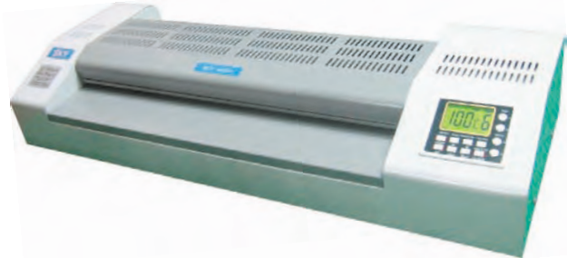
SKY 490 R6