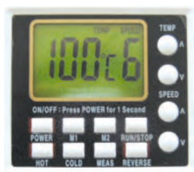
SKY 490 R6