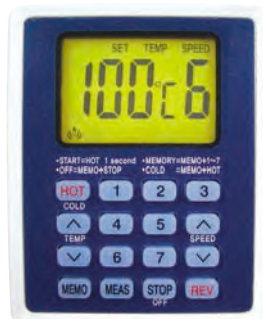
SKY 480 R6