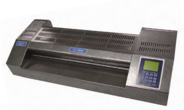
SKY 480 R6